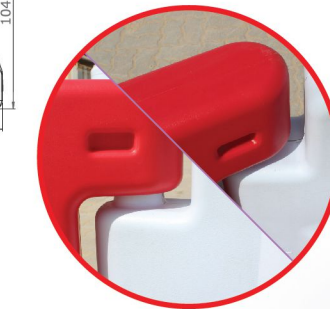
male-female pin system